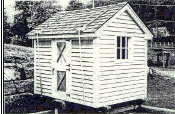
The 2003 UVSG Playhouse to be raffled.

Our playhouse for this year is ready to go on the road and will appear in several Upper Valley locations from now through August 10, when the winning ticket will be drawn.