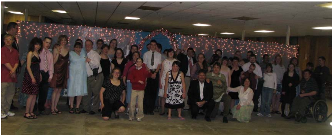
Happenings Semi-Formal Spring Dance