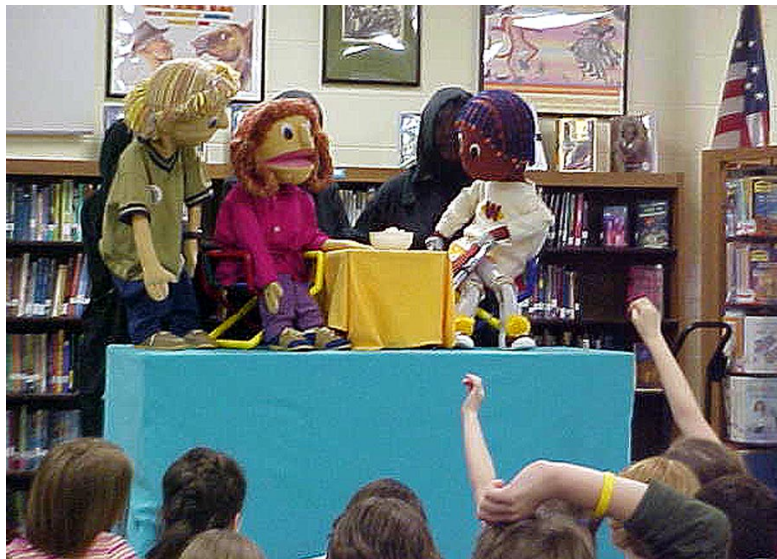
KOB presenting to a school group

* Presentations were made to 14 different audiences totaling 1000 students and staff this year. Requests were way down this year (we think that schools are both too busy with excess testing and/or have more limited money for auxiliary learning experiences such as KOB), so a major effort next year will be to increase again the number of requests for KOB, through increased marketing and also fund raising/grant writing in order to make them completely free to schools all over the state of NH. We hope then to keep our seven very dedicated volunteer puppeteers much busier.